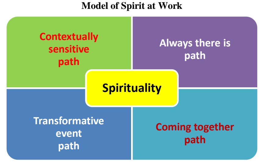
Diagram / Picture No.2

The wholesome is spirit at work, powered with distinct characteristics by profound feelings of wellbeing, a belief that one is engaged in meaningful work, a connection to others and common purpose, a connection to something larger than self, and it has a transcendent nature. A study reveals that, a spirit at work is identified based on the following cogent path;